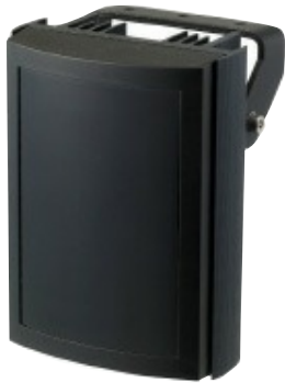
SSI-I 200 4 emitter infra red unit

High efficiency infra red and white light LED units